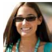
Outdoors: Bright Light