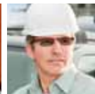
Outdoors: Mid Light