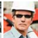
Outdoors: Bright Light