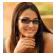
Outdoors: Mid Light